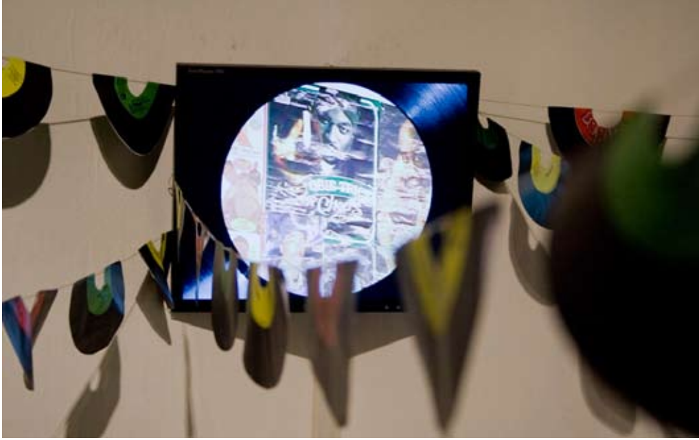
Exhibition view. Hair At Habties. Bus Gallery. Lucreccia Quintanilla and Jason Heller.

the magazine paper without realising it. Whilst some might see this as a basis for scoffing, I see it as one of the most fecund points of cultural production in Australia. It's like a distillation, an apprehension via essences and signifiers which become raw materials for cultures which are being built here, and is all the more rich and complex for that.